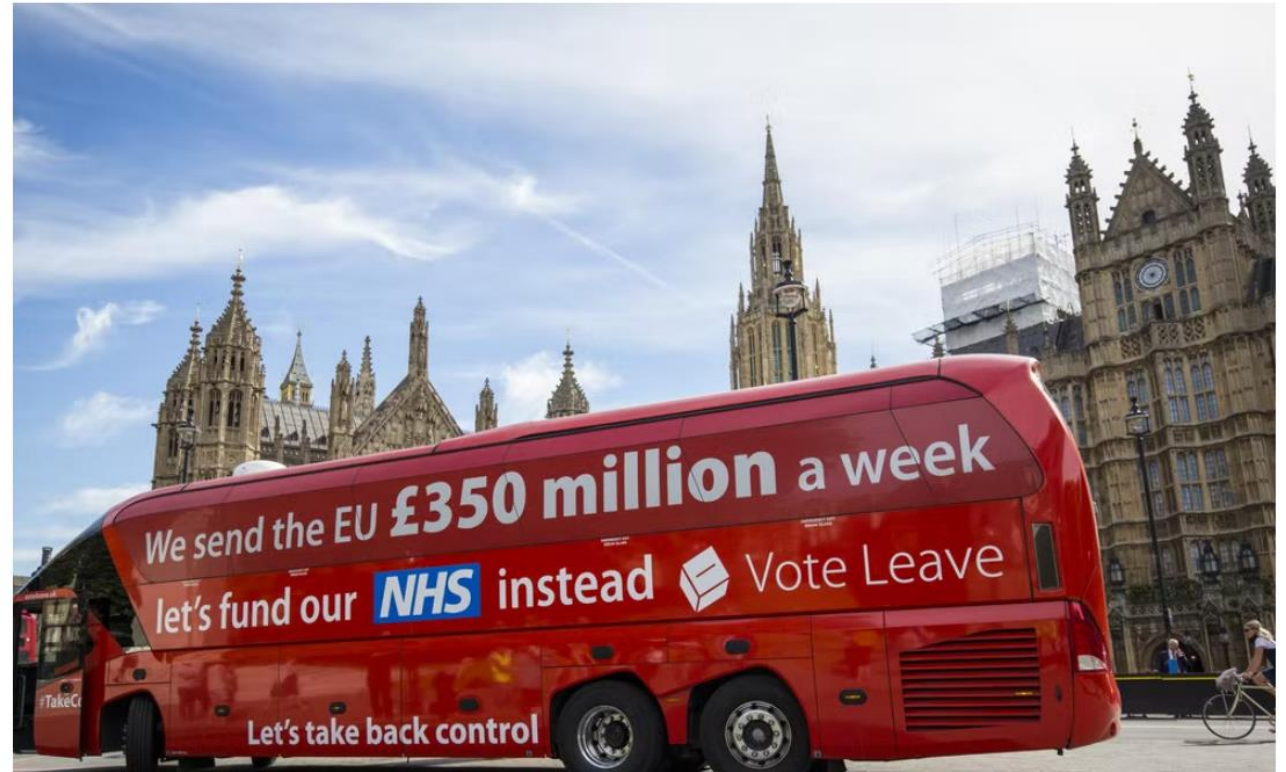
Tweets from Lavern Spicer