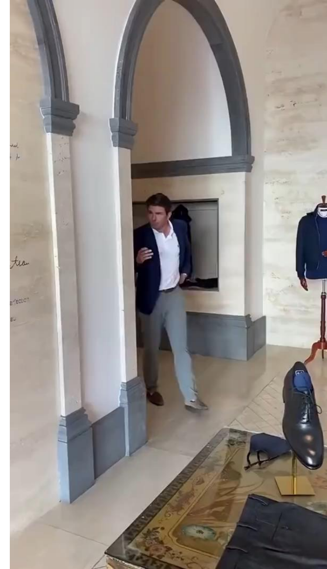
How a deepfake Tom Cruise on TikTok turned into a very real AI company | CNN Business