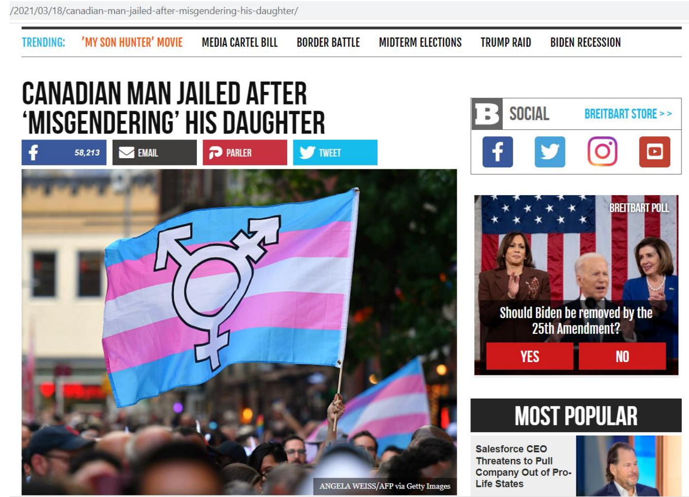
Breitbart article – Misleading title