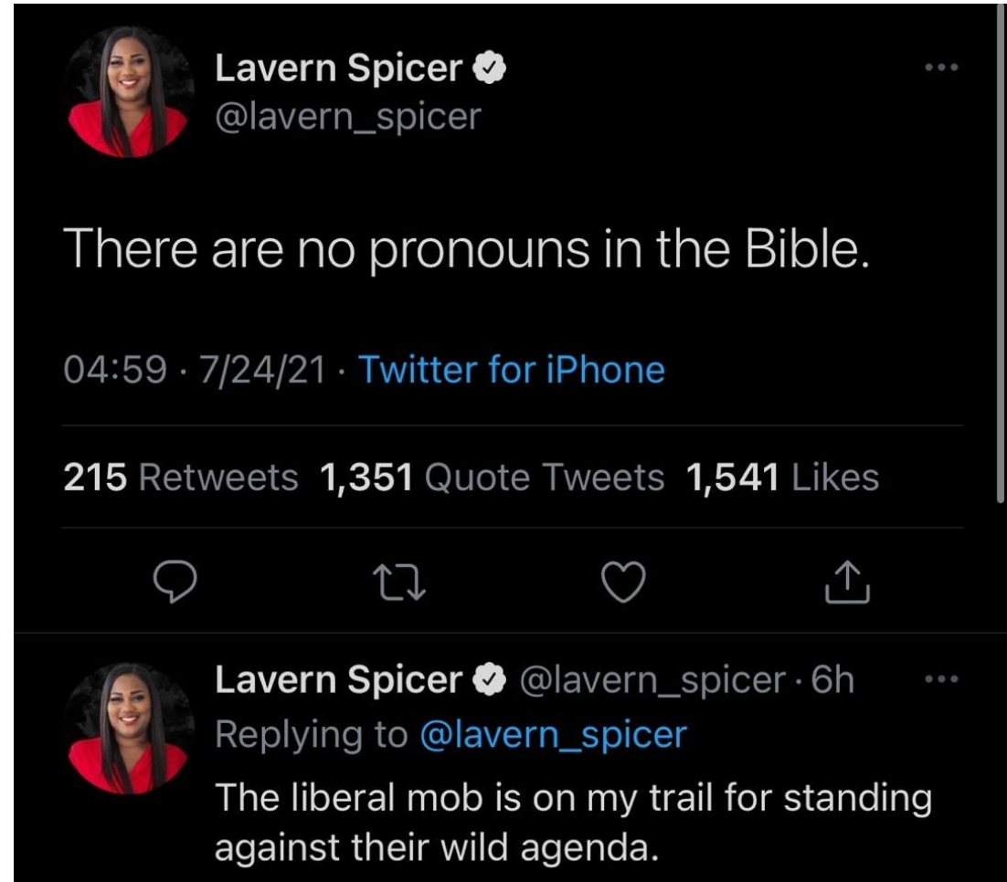
Tweets from Lavern Spicer